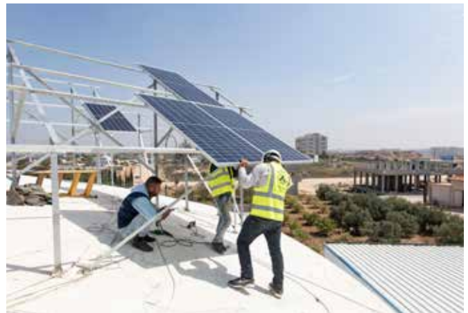
Al Kawther Solar Well

Muslim Hands built over 3,100 new wells in 2019. These wells provide clean tested water to disadvantaged communities, transforming thousands of lives, including improving their livelihoods, agriculture, education and health. We also establish local water committees where we build these wells. These committees ensure the upkeep and maintenance of the wells and provide ongoing training and hygiene awareness in their communities.